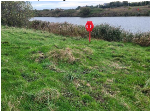
Location of Reptile Refugia

In order to provide a suitable habitat for the reptiles that were translocated, five reptile refugia (solar-heated refuges for reptiles) have been constructed.